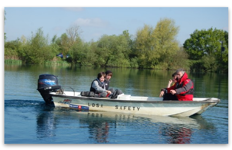
Powerboating at last year's Weekend on the Water