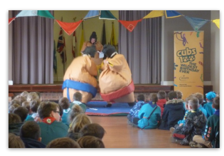
A highlight from last year's St George's Day event